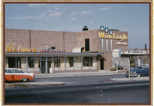
The Wantagh Movie Theater back in 1961, note the movie playing at the time “Mr. Sardonicus”

Wantagh Cinema was later operated by RKO-Century-Warner and finally by Cineplex Odeon until its closure in September 1989 when many in the community were sad to see it converted into an office building that remains there today. 📖