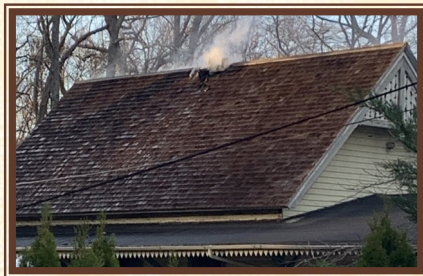
Small Fire on the Museum Roof

During last year’s Winter Wonderland, the roof of the Wantagh Museum sustained a small amount of damage from a localized fire. The Fire Department was very careful in the way they extinguished the fire so that further damage would be minimized. They removed all of the artifacts that were not in showcases and safely stored them on the train. The roof is now tarped and the museum is secured. We keep you updated on steps moving forward. 📖