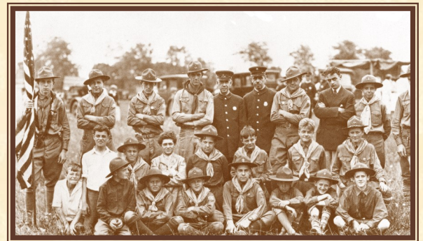
Boy Scout Troop 95, Circa 1927