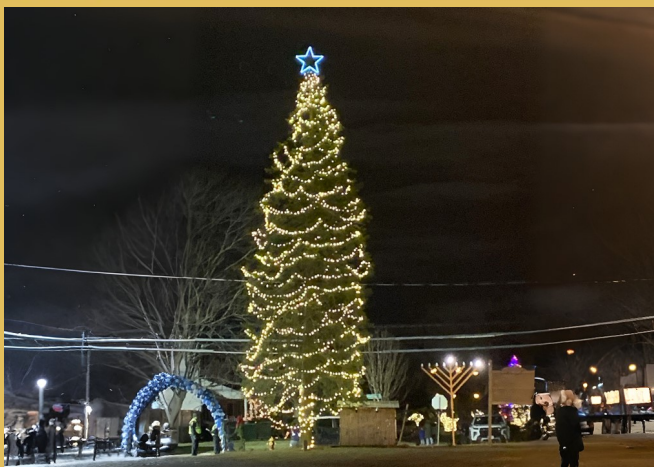
Christmas Tree and Minora Lighting at last year's Wantagh Winter Wonderland Event