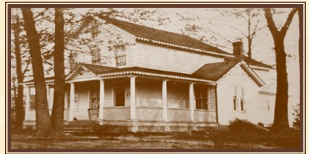
McGee House, 3704 Park Avenue, Circa 1921