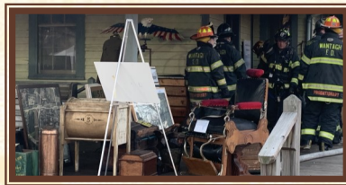
Firemen and Other Volunteers Move Artifacts