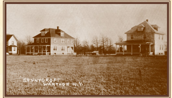
Sunnycroft area of Wantagh included Oakland, Locust & Seaford Avenues, south of Sunrise Highway